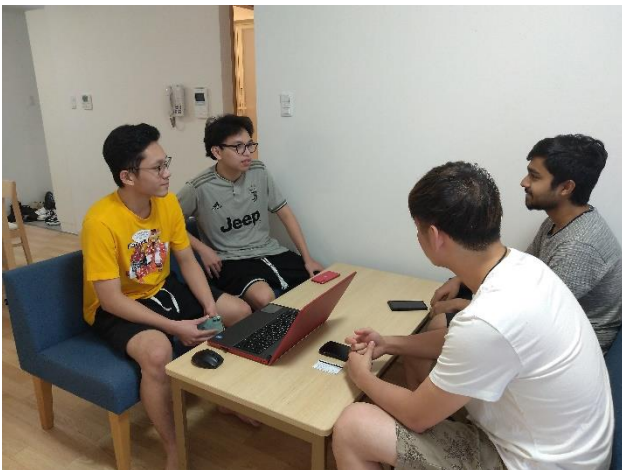
In the Unit