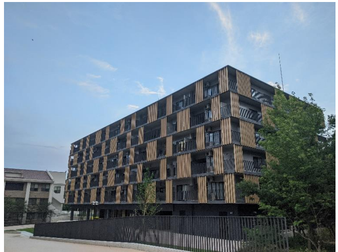
In the Unit